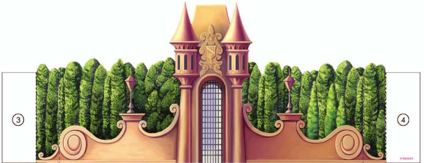
FRONT PANEL OF CASTLE