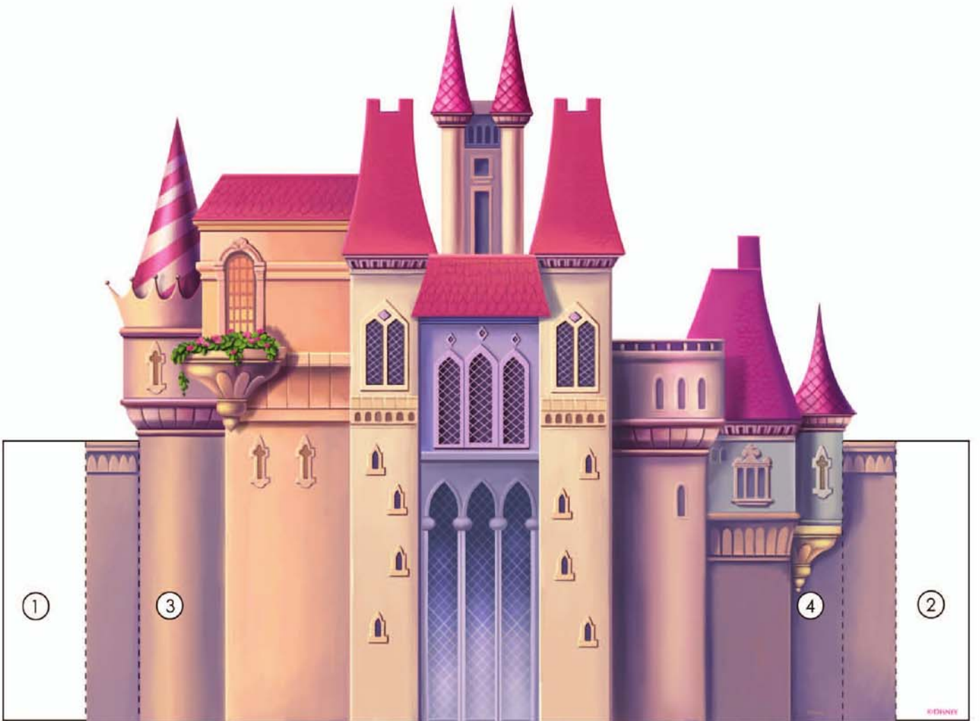
MIDDLE PANEL OF CASTLE